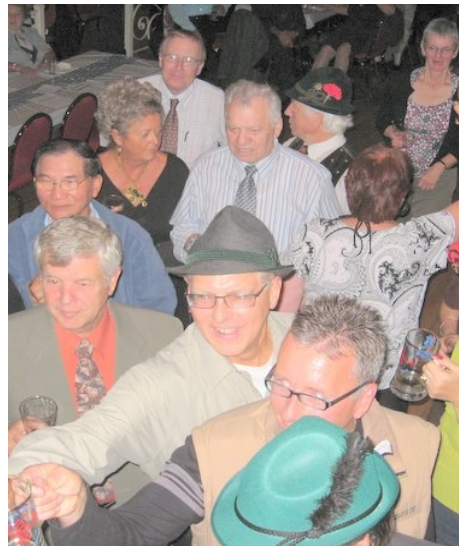
Thirsty Beer drinkers getting their fill of the Freibier at the Steel City Oktoberfest.