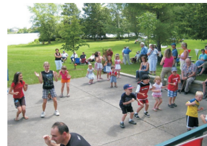
Children dancing and having fun