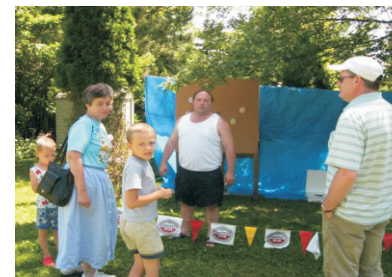
Carnival Games - fun for all