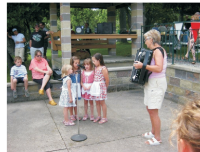
Aren't these girls just so cute!!