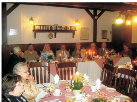
Ladies Stiftungsfest March 14, 2010