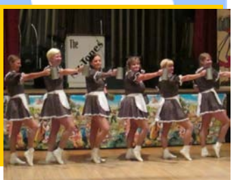
Back by popular demand The Narragonia Dancers

Admission $10.00 $5.00 for club members FOR INFORMATION AND TICKET SALES CALL THE GERMANIA CLUB at 905-549-0513