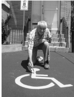
The finishing touch, just a little "Art work".