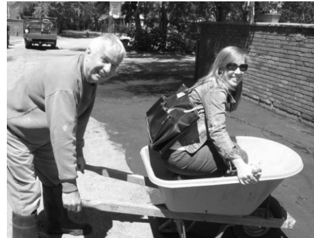
Here is a Classic. During the painting of the driveway this lady was visiting the neighbor next door 865-1/2, King Street but with the still wet, black sealer on the driveway, there was only one way to get over to the other side.

Yes, jump in the wheelbarrow and Arthur will get you to the front Door!